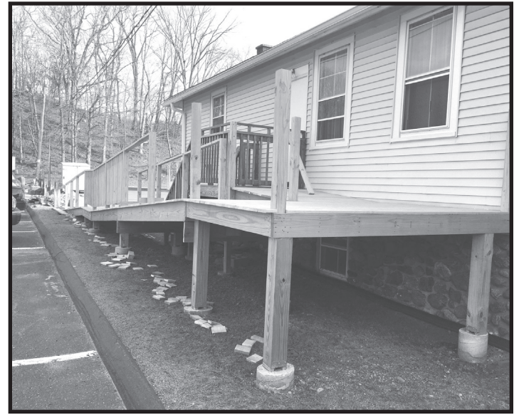
Thanks to the hard work of Hank Rotzal, the new handicap ramp at Oxford Grange is progressing well. These photos were taken on January 13.