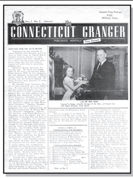
The second issue of the Connecticut Granger from January of 1960

The old saying holds true - - "Everything old is new again"!