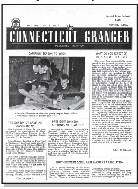
The May 1965 issue of the Connecticut Granger in the early format.