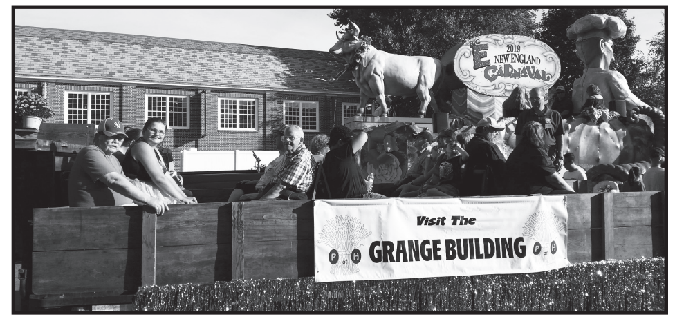
Grange members (including many from Connecticut) wait for the beginning of the Big E Daily Parade on Grange Day, Sept. 22.