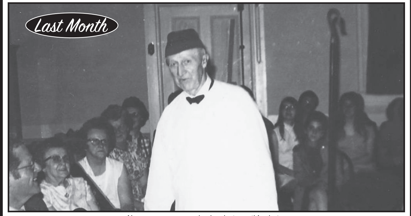
No answers were received on last month's photo.