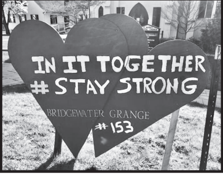
Bridgewater Grange shows its support for their community with this sign outside their meeting place.

While we are confined in our homes, let's work on our knitting, needlework, crafts and pictures so we have plenty to judge on Let's