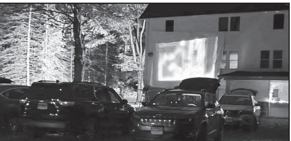
Greenfield Hill Grange continues their Drive-In Movie nights at the Grange

Wishing every one of my readers a truly joyful Thanksgiving.