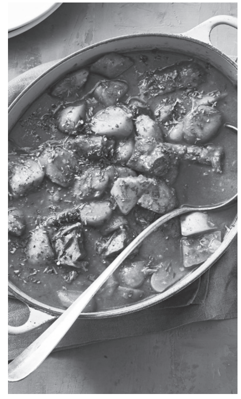
Serve sprinkled with parsley.

Step 4: Return beef and any juices to pot along with potatoes, thyme, and bay leaves and simmer, covered, 11/2 hours. (Alternatively, transfer to 325°F oven and bake, covered, 2 hours.) Remove lid and cook, uncovered, until beef is very tender, 45 to 60 minutes. (If baking, uncover and bake 45 minutes.) Discard thyme and bay leaves. Season with salt and pepper if desired.