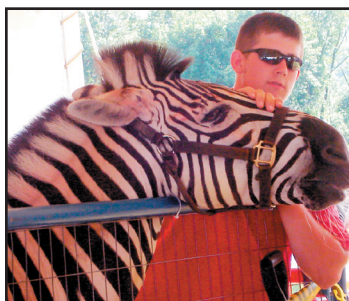
(below) Fun in the Petting Zoo with the Zebras and Camels.