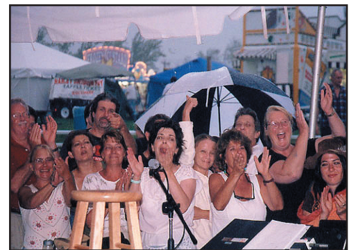
(above and right) It was a Saturday to remember when Folk music legend Richie Havens took to the Main Stage. Half-way through his performance, the torrential rains began. Richie continued on despite the rains, inviting everyone to come under the tent and join him, while he continued with an inspirational performance. He closed the show with a prayer for the rain to end, and shortly thereafter, the storm cleared. Many fairgoers referred to the show as a "Woodstock-like" experience.