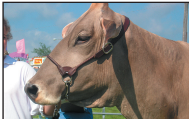
(below) Getting ready for the beef and dairy judging.