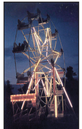
(above) The Ferris Wheel lights up the night sky.