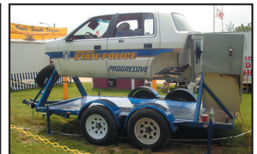
(above) The Connecticut State Police showcased the Seat Belt Convincer and the Roll-Over Simulator all three days, educating fairgoers on vehicle safety.