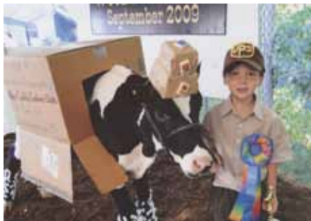
Woodstock Fair

Cannon Grange Agricultural Fair P.O. Box 23 Wilton, Connecticut 06897-0023 203.762.1900 cannon.grange@yahoo.com